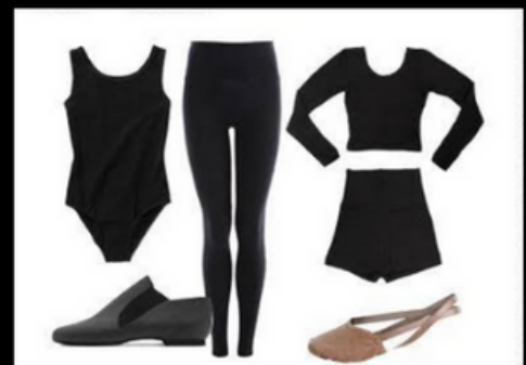
AGES 7-18 JAZZ