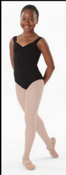
AGES 7-18 BALLET&LITURGICAL

The simple uniforms make it possible for the faculty to see the student's bodies so they can make the appropriate corrections.