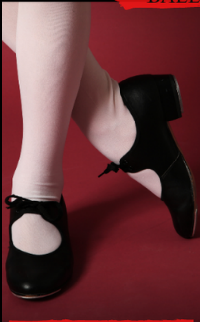
AGES 3-6 TAP