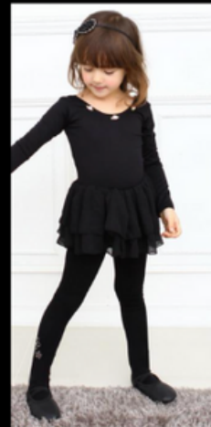
AGES 3-6 BALLET&LITURGICAL