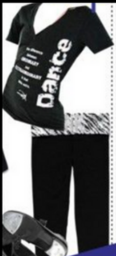
AGES 3-6 TAP