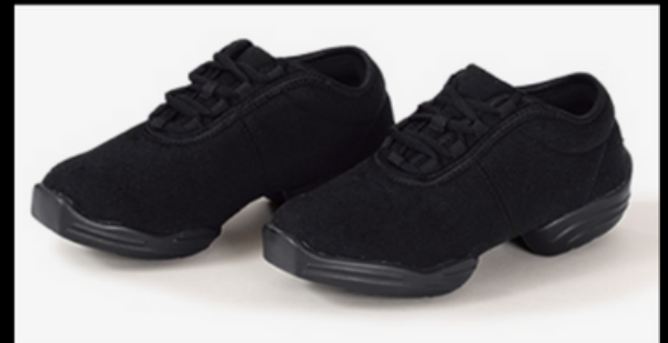
AGES 3-18 HIP-HOP