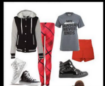
AGES 3-18 HIP-HOP