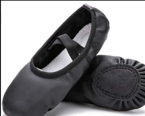
AGES 7-18 BALLET&LITURGICAL-

The simple uniforms make it possible for the faculty to see the student's bodies so they can make the appropriate corrections.