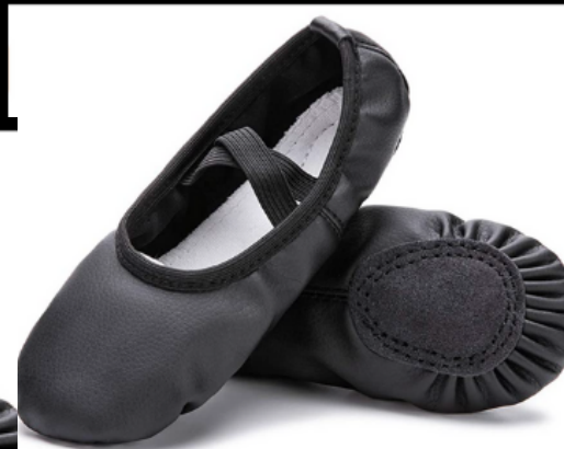
AGES 3-6 BALLET&LITURGICAL-